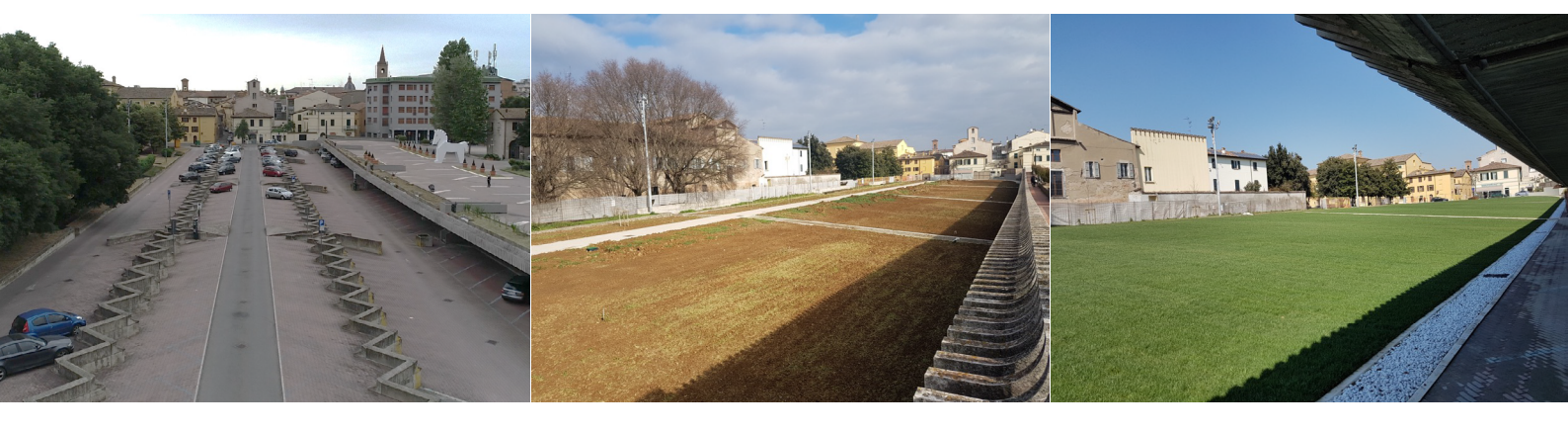
Figure 5. Demo site in Forlì (IT) before, during and after the de-sealing intervention

One of the more interesting communication products created in the post-LIFE period is a video filmed by the project SOS4LIFE that recorded the steps necessary for implementation of de-sealing operations: removal of pavement and concrete structures, laying down of new soil, and greening of the area. The video is available on the project's YouTube channel: <u>https://www.youtube.com/watch?v=W4s7pNNjkSQ</u>.