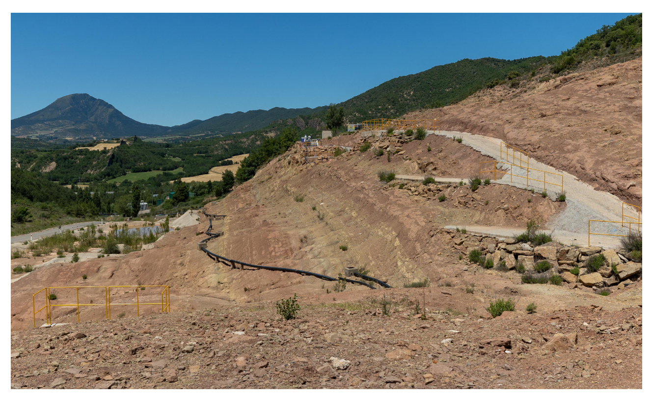
Figure 1. Old Bailín landfill (ES) in which the DISCOVERED LIFE actions have been carried out

As for the remediation sector, four projects out of five have continued monitoring the sites where the original decontamination activities were implemented. Beyond the pedological aspects, the projects DISCOVERED LIFE and NorthPestClean are also carrying out hydrogeological monitoring of the polluted areas: the latter's activities are actually implemented within the LIFE project Coast to Coast Climate Challenge (LIFE15 IPC/DK/000006).