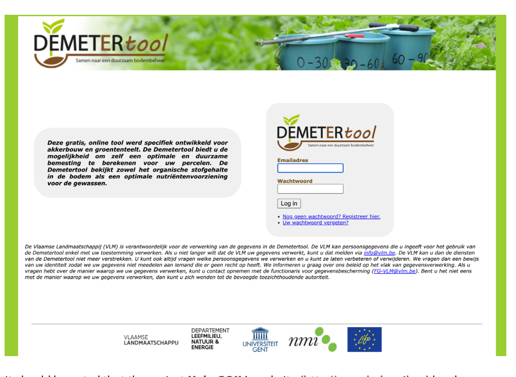
Figure 6. LIFE DEMETER online tool

It should be noted that the project Help SOIL's website (http://www.helpsoil.eu) has been very successful: it is still active (although 5 years have already elapsed) and continues to draw interest from the audience, especially agricultural sector stakeholders. More than 30,000 visitors per year have been registered after the project's end and therefore the beneficiaries intend to keep it updated in the coming years.