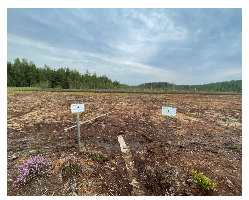
Figure 4. Demo site in Kemeri (LV) visited by stakeholders

Since the end of the project LIFE REstore , the demo site Kaigu mire has been visited by around 100 people every year – mainly students from the University of Latvia as well as experts and representatives from different institutions and organisations. At the same time, at least 190 people have visited the demo site in Kemeri (Latvia) where sphagnum planting took place. Representatives from the Lithuanian Fund for Nature visited the site and then planted sphagnum in the Aukštumala bog in Lithuania within another project, LIFE Peat Restore (LIFE15 CCM/ DE/000138).