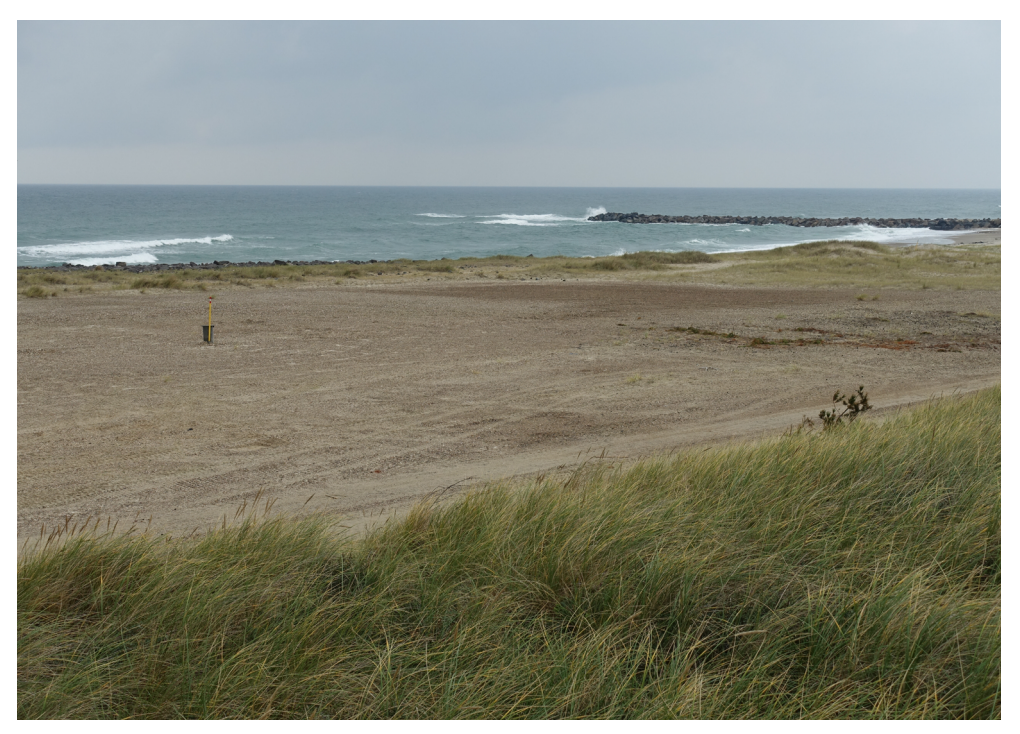
Figure 2. The Groyne 42 site: not much reveals that this is one of the 10 most seriously polluted areas in Denmark

Among the projects dealing with soil remediation, it should be noted that the ISCO technique, tested by the project DISCOVERED LIFE , has been included in the strategic plan of the Government of Aragon (Spain) to reclaim industrial areas polluted by lindane (a substance used for the production of insecticides). Similarly, the results of the project NorthPestClean have been used by the Central Denmark Region to plan cleaning of the area where the project solutions were tested as part of a programme for remediation of the 10 most polluted sites in Denmark.