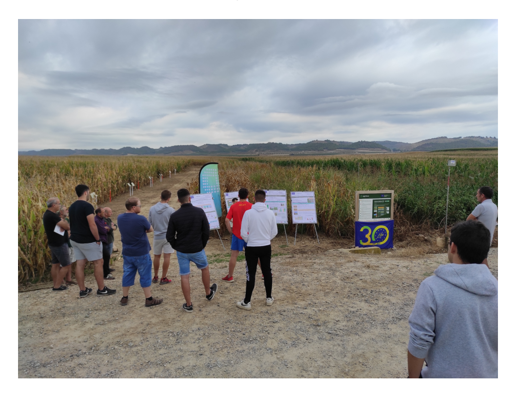
Figure 3. Training of young farmers in Castelló de Farfanya (ES)

The agricultural sector projects have been quite active in involving stakeholders, as direct contacts are deemed essential to disseminate innovations among farmers. The key factor for the success of these initiatives was networking with other local projects or events that ensured the required financial resources. In this regard, the monitoring team had the opportunity to attend an on-field training session during the ex-post visit to the project FARMS 4 FUTURE : the event was organised in collaboration with the project LIFE AGRICLOSE (LIFE17 ENV/ES/000439).