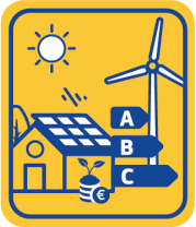
Clean Energy Transition