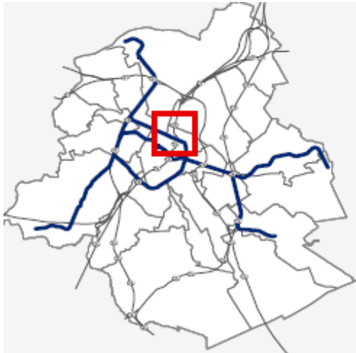
Map: access to COV2 by public transport

Access by train: Gare du Nord / Brussel-Noord