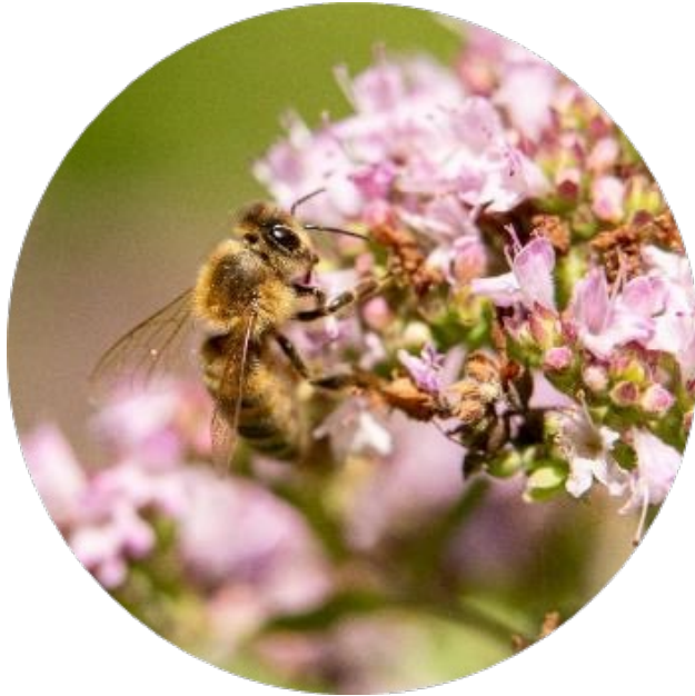
Nature & Biodiversity