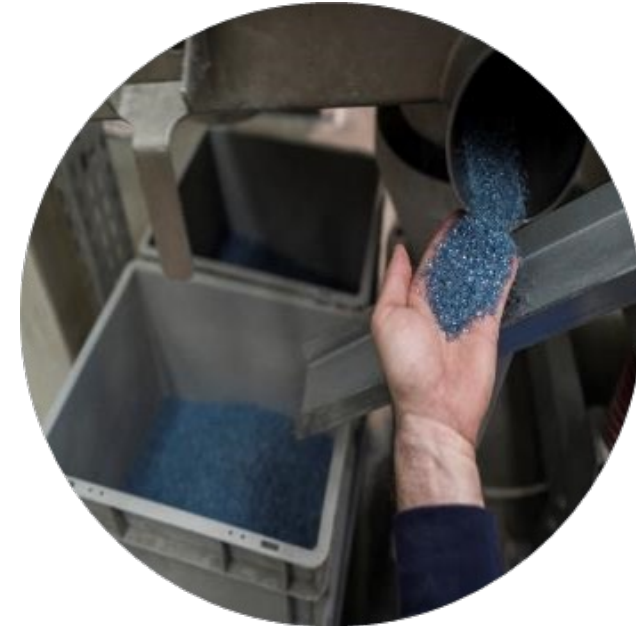
Circular Economy and Quality of Life