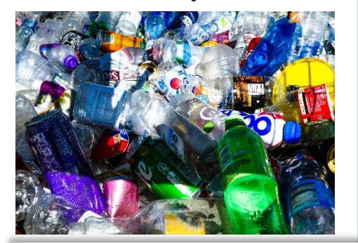
Environmental crimes directive