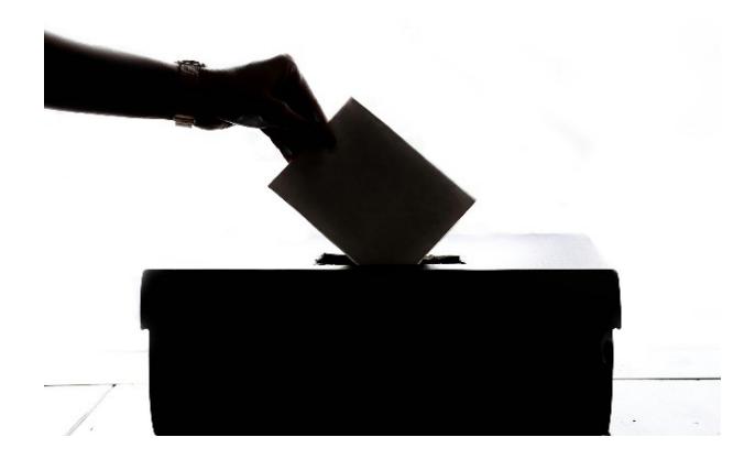
European elections in June 2024 new strategic priorities