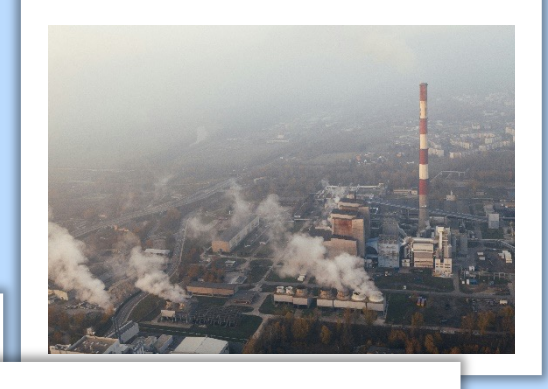
Critical raw materials