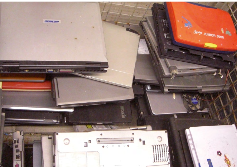
Collected notebooks before refurbishment

The recycling of electronics is more and more common. However the devices are generally scrapped for metals with a low recovery rate, and all of the currently non-recyclable parts are wasted in the process. The project sought to implement an alternative reuse scheme. A new system for collection, refurbishment and distribution of notebooks was designed. It grants used notebooks a 'second life', avoiding the environmental and resource costs associated with the production of new ones.