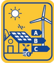
Clean Energy Transition

predecessors: H2020 – Energy Efficiency market uptake