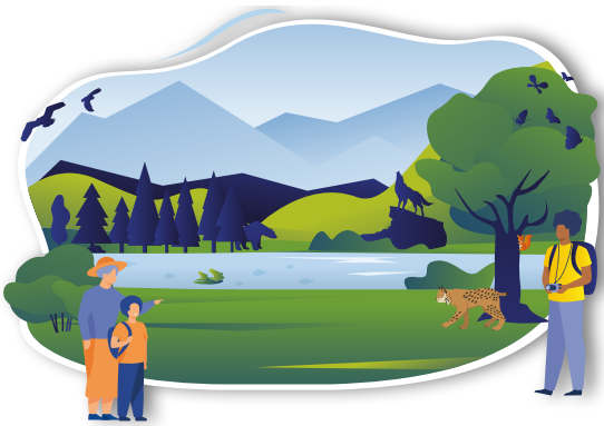
NATURE AND BIODIVERSITY