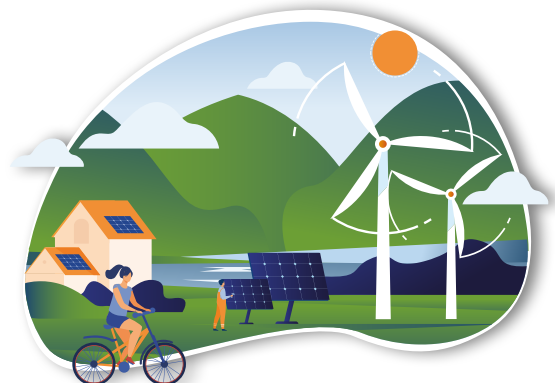
CLEAN ENERGY TRANSITION