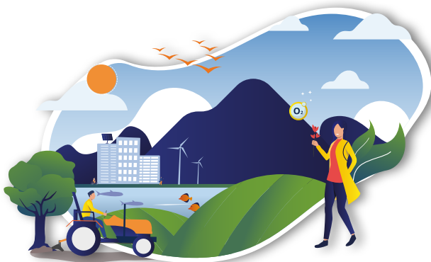
CLIMATE CHANGE MITIGATION AND ADAPTATION