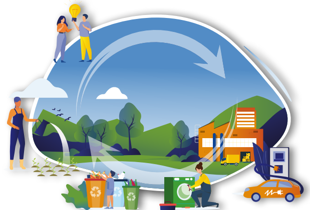
CIRCULAR ECONOMY AND QUALITY OF LIFE