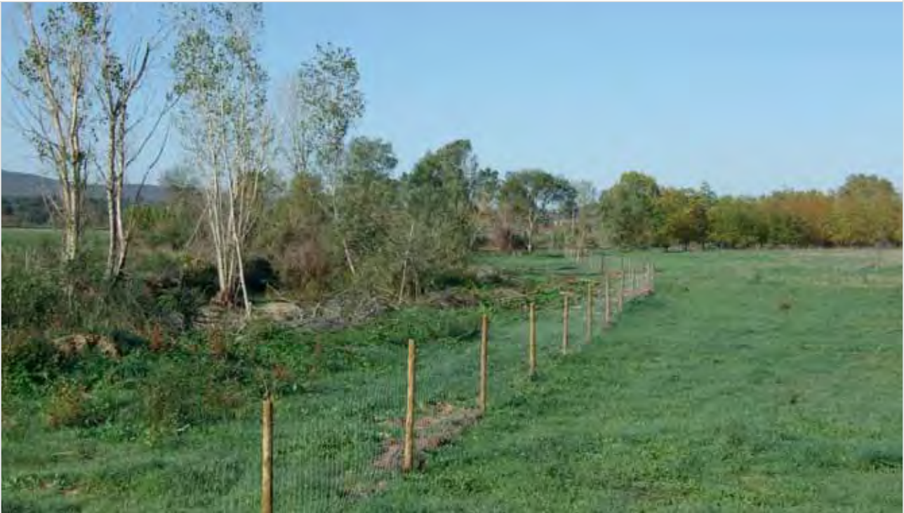
Fences were erected to restore riparian vegetation by keeping grazing livestock away from the banks of streams

Looking back, he considers the public participation aspect (which also included such dissemination activities as posters, leaflets, a website, guided field visits and lectures at fairs, universities and schools) as a major achievement in a region often adverse to nature conservation issues and Natura 2000. "It was a very important tool - It was one of the most important actions of the project with some of the best results," believes Mr. Santos. "It's something we are still trying to do right now... being able to work with people - landowners, hunters and farmers - and having their trust and being able to develop partnership agreements with them. To show that it is possible to work together with the common goal of conserving the habitats of species such as the Iberian lynx."