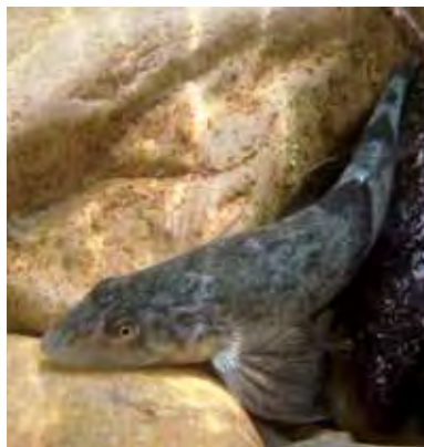
Rhône streber ( Zingel asper )

An important achievement concerned the construction of five fish passes to allow intra-population mixing and population increases between favourable hab-