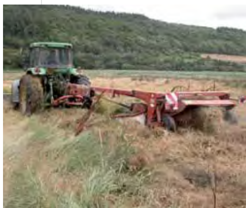
Cutting of invasive plant species

To address this issue, the "Acrocephalus Bretagne" project (LIFE04 NAT/FR/000086) set out to maintain or improve the ecological status of three important stopover marshes in Brittany and to disseminate the know-how gained to other coastal marsh restoration efforts. Knowledge of the species would be improved through radio-tracking and by carrying out an inventory of additional spring migratory stopover sites.