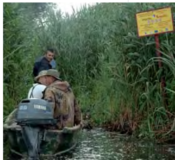
Pelican colony sign and wardens

Another positive outcome of the project was the designation of all six breeding sites covered as Natura 2000 network Special Protection Areas (SPAs). However, the approval of the main strategic documents for future conservation management – a management plan, designation of the sites as core areas within the Danube Delta and a national action plan – is still pending.