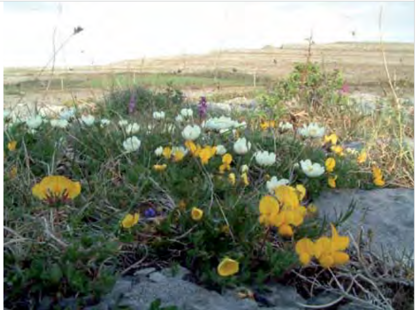
Limestone heaths are common in the Burren, where they contain a wonderful mixture of acid-loving and lime-loving plants

A pilot project of this nature requires a considerable amount of preparation and monitoring in order to ensure that the pilot mechanisms would be transferable to the whole Burren farmland region. These preparations, covering the first three years of the project, included: (i) talking to the local farmers and generating support for the scheme; (ii) selection of the pilot farms; and (iii) the drawing up farm management plans for each of the selected sites.