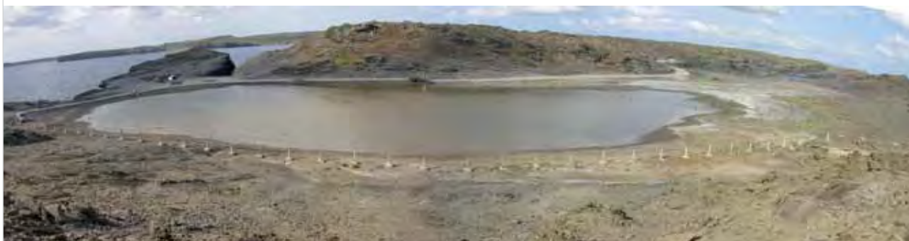
The LIFE project implemented management plans for the Natura 2000 sites with temporary pond habitats

Studies carried out for the LIFE project also showed that the Mediterranean tree frog ( Hyla meridionalis ) and the Balearic green toad ( Bufo balearicus ) – species of European Community interest listed in Annex IV of the Habitats Directive – are compatible and don't suffer from inhabiting the same pond. The population of the toad is decreasing in Minorca, however, and "conservation of the ponds is very important for