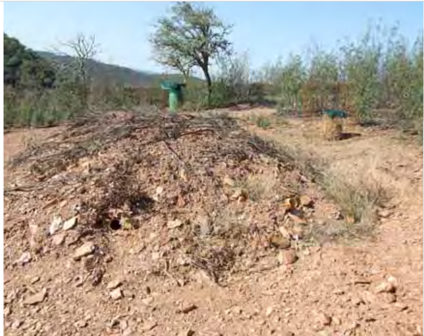
Rabbit "nest" protection site built by the project

Actions were taken to create better conditions for the rabbit population, including the sowing of 60 ha of pastures to improve feeding conditions and the installation of 100 rabbit shelters, 72 water suppliers, 15 watering points and 120 feeders. The project team also created areas of natural refuge by planting and seeding more than 3 000 plants of typical native species (holm oak, cork trees, strawberry trees, Italian buckthorn and oleaster) and by protecting