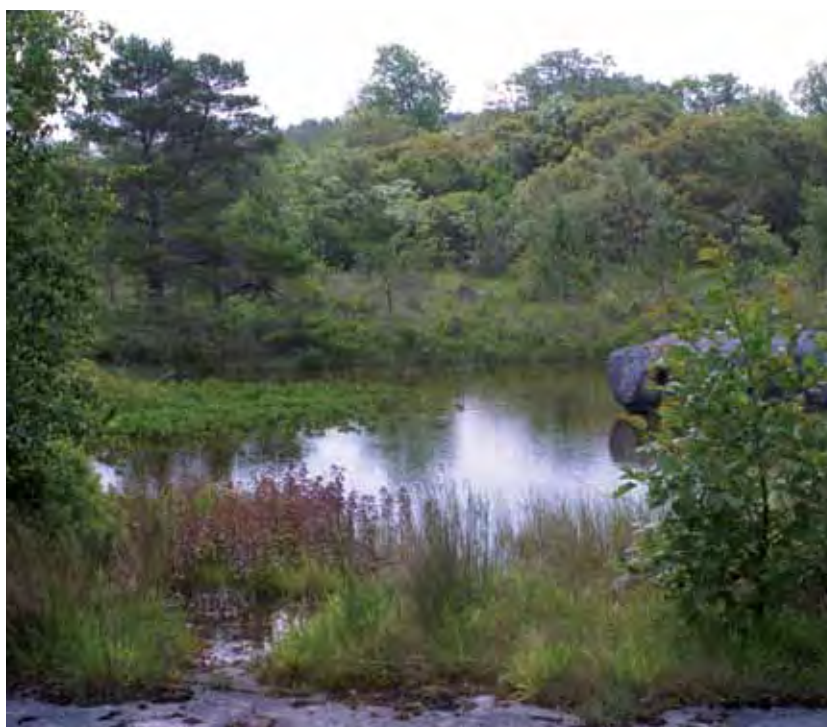
Ash/ hazel natural woodland associated with limestone pavement at the Clonbur ‘demonstration site’ on the Galway / Mayo border