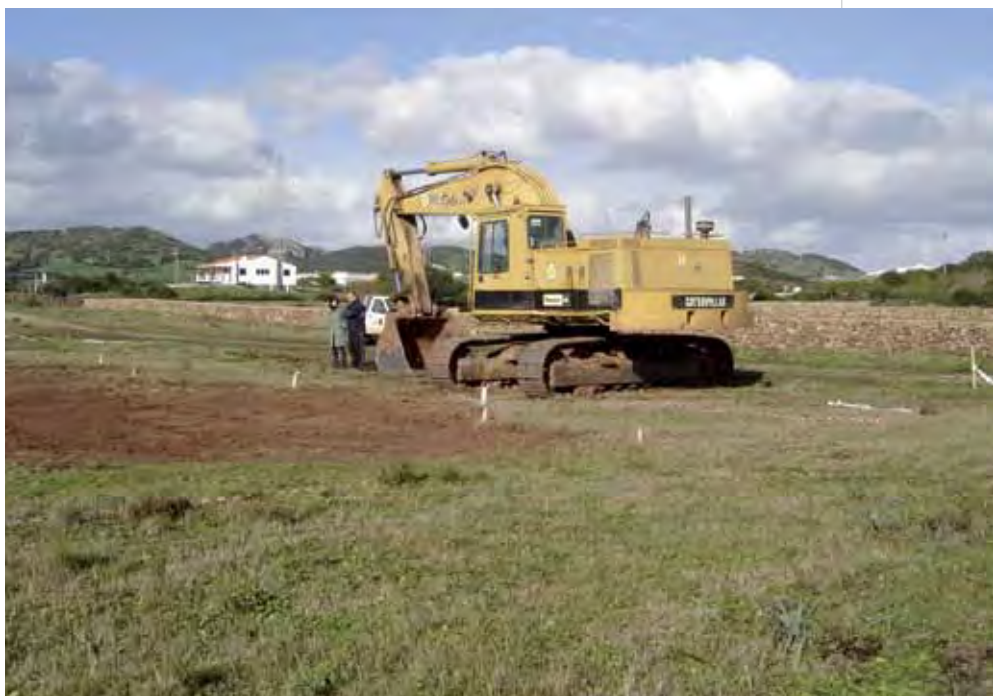
Excavation of an experimental temporary pond for educational purposes in Santa Eularieta