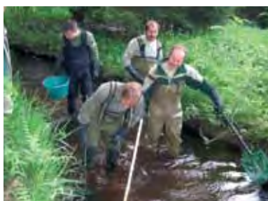
Inventories of habitat condition and species status provided a crucial baseline for project actions

Much of the LIFE project's co-finance was invested in testing and demonstrating new techniques for restoring the headwater