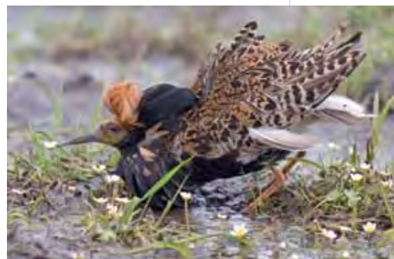
Ruff - one of the bird species helped by this project

Although the various actions taken have not yet successfully stopped the decline in numbers of breeding meadow birds at the four project sites, it is hoped that there will be a notable positive long-term effect. Funding for the installations established during the REMAB project will continue at