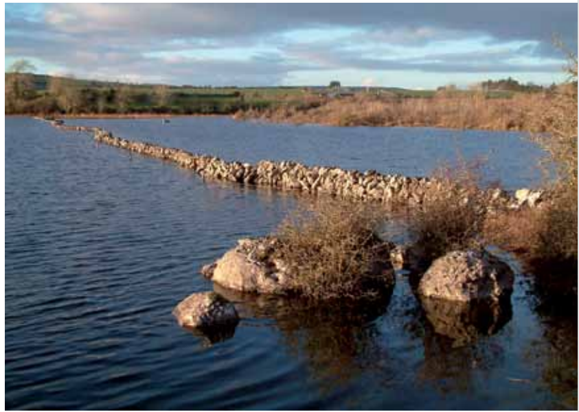
Turloughs are disappearing lakes, formed where a limestone depression is intermittently flooded, generally in winter. They are normally filled through underground springs and holes

The project monitored the outcome of its actions on priority habitats, water