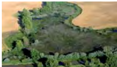
The conservation status of the wetlands has been improved thanks to the actions of this LIFE Nature project

The aim of the Canal de Castilla project (LIFE06 NAT/E/000213) was to implement a programme for the recovery, management, and monitoring of the 35 small wetlands connected to the Canal de Castilla. Results show that the project has had a positive effect on the wetlands' conservation condition. Hydrological restoration of drained wetlands (e.g. by building inlets) has improved the water level of 13 ponds.