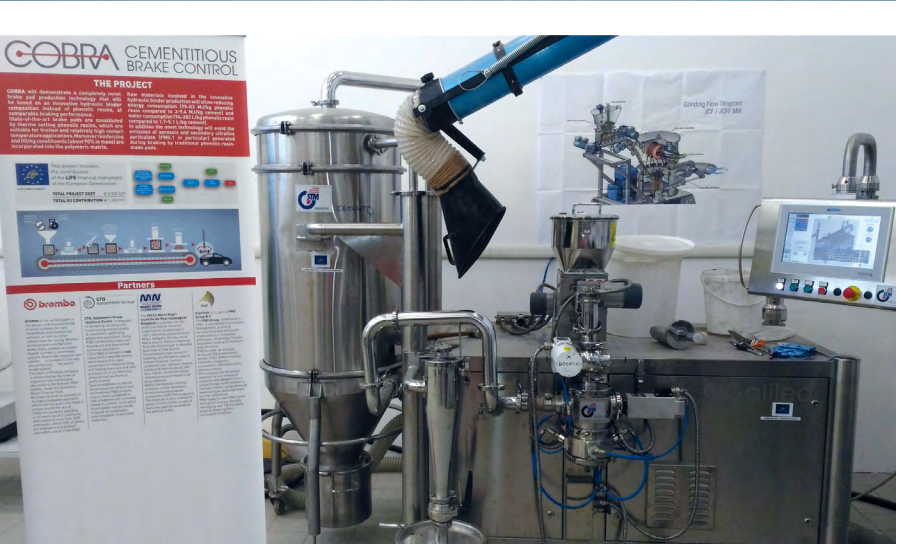
Illustration: LIFE13 ENV/IT/0004