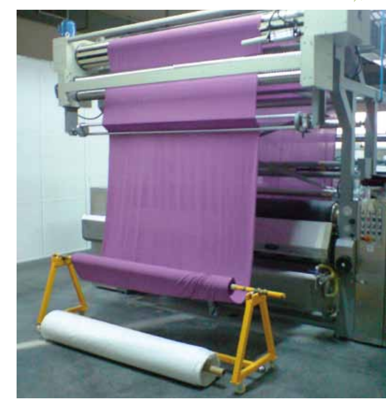
'BATinLOKO' produced a tool that allows textiles companies to understand which BATs they should implement to improve environmental performance and why

One of the major difficulties of encouraging implementation of BATs across the textiles sector is how different individual