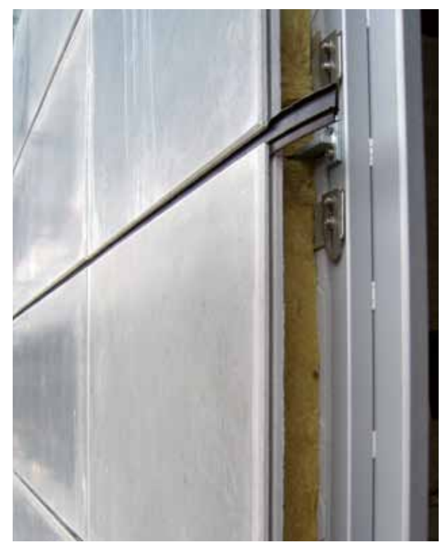
The basic element of construction is made of two shells of textile reinforced concrete combined with rigid polyurethane foam insulation

Textil in Frankfurt and at Innotex, had begun in 2007 ahead of the installation proper. In June 2009, the completed building was made available to the ITA, and in the sixth phase, an ecological and economic assessment of the new facade system was carried out.