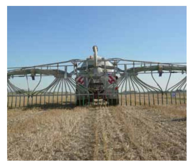
Trailing hose system for slurry application

aware of environmental issues and more engaged with correct slurry management since they joined their SWME.