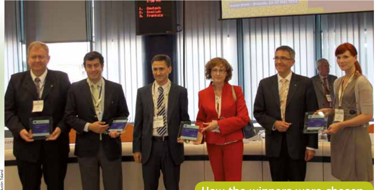
The winners of awards for the Best LIFE Environment Projects 2011

the audience in Brussels that LIFE funding had helped the project partnership to, "Test and demonstrate an innovative hydropower plant which overcomes environmental challenges faced by previous equivalent technologies...LIFE's support resulted in us finding a new way of keeping hydro plants green."