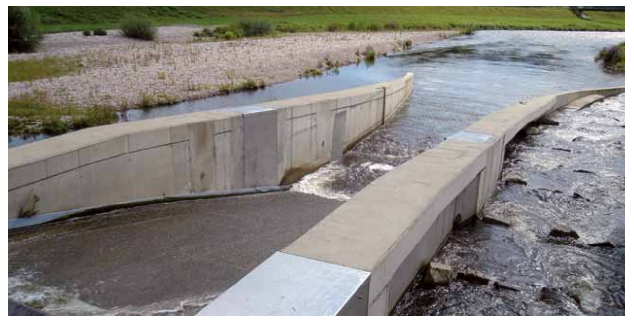
With the hydropower plant fish are free to pass above and below the turbine and various fish species have migrated through the river Kinzig to reach their former spawning grounds

erected; at Offenburg it was necessary to extend this by three steps because of the depth of the water.