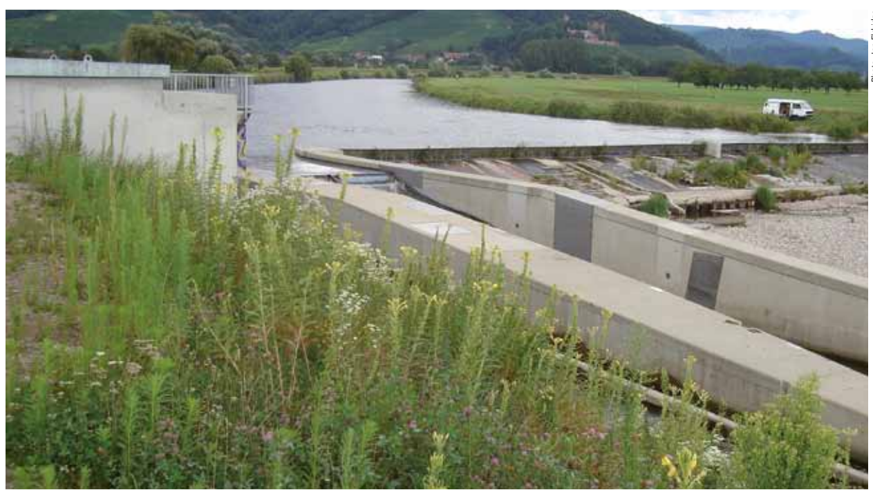
The two new 'Moveable HEPP' hydropower plants are capable of producing some 4 650 MWh/yr of energy

This aim was achieved by integrating movable hydropower plants into existing weirs at Gengenbach and Offenburg: the funnel-shaped main body of these hydropower plants houses