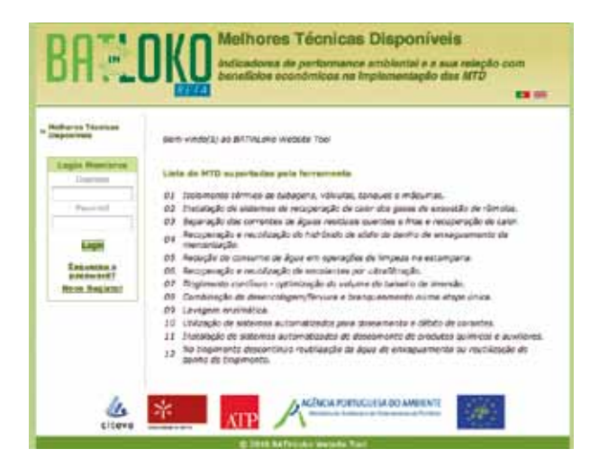
The web tool created by the 'BATinLoko' team

participating companies. A different model was developed for each BAT, using different input variables to calculate the anticipated benefits. For example, key variables for different BATs might include the volume of water used, the diameter of the pipes, the required temperature of the process or the volume of chemicals added.