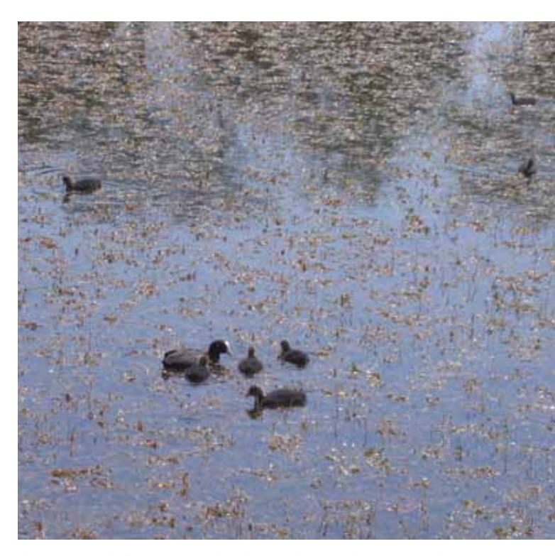
The presence of white-water crowfoot (Ranunculus aquatilis) is a sign of the lakes' improved condition

Once the coagulant had been added, the project team changed the fish stocks of both lakes. Cyprinidae (carps, bar-