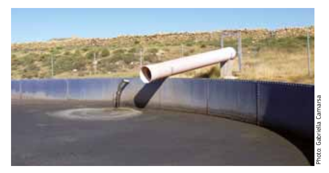
Storing slurry in tanks enables the fertiliser to be used at the right time of the year and avoids the losses of nutrients and subsequent pollution

Three sites in Aragon were selected - in Tauste, Maestrazgo and Peñarroya de Tastavins. They share the same environmental problem (i.e. the production of high volumes of pig slurry). However, the management solutions needed to be capable of working effectively for the different locations.