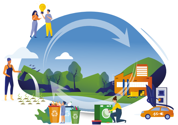
CIRCULAR ECONOMY AND QUALITY OF LIFE