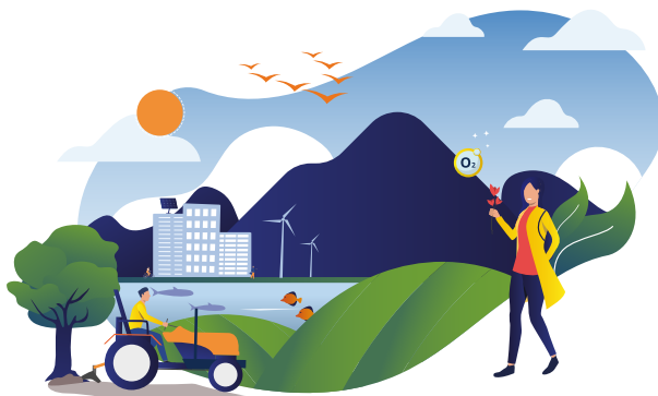
CLIMATE CHANGE MITIGATION AND ADAPTATION