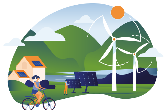
CLEAN ENERGY TRANSITION