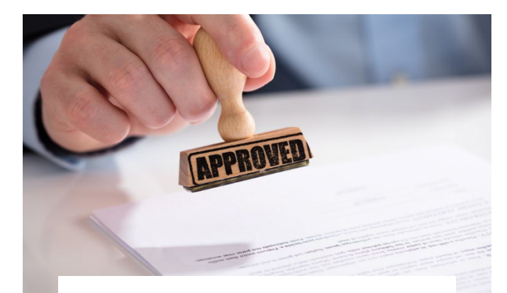
Adaptation of legal, administrative and funding frameworks